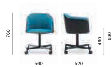
886 Armchair, upholstered shell, die-cast aluminium four-star base with castors