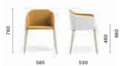
884 Armchair, upholstered shell, ash wood legs