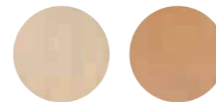
FR Bleached ash Frassino sbiancato N1 Light walnut Noce chiaro