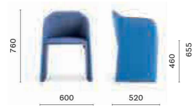
889F Upholstered armchair