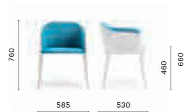
885 Armchair, upholstered shell, die-cast aluminium legs