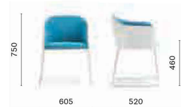
881 Armchair, upholstered shell, steel tubular frame