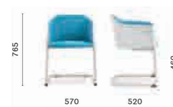
882 Armchair, upholstered shell, steel tubular frame