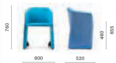
889G Upholstered armchair with castors