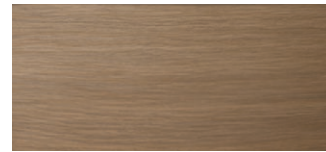
DARK STAINED OAK