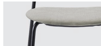
BLACK POWDER COATED STEEL