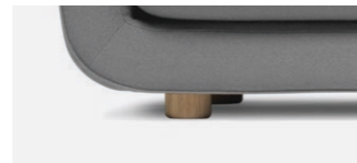
DARK STAINED OAK