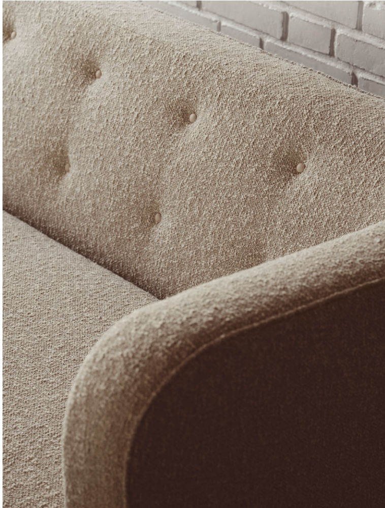
VILHELM, SOFA Designed by Flemming Lassen