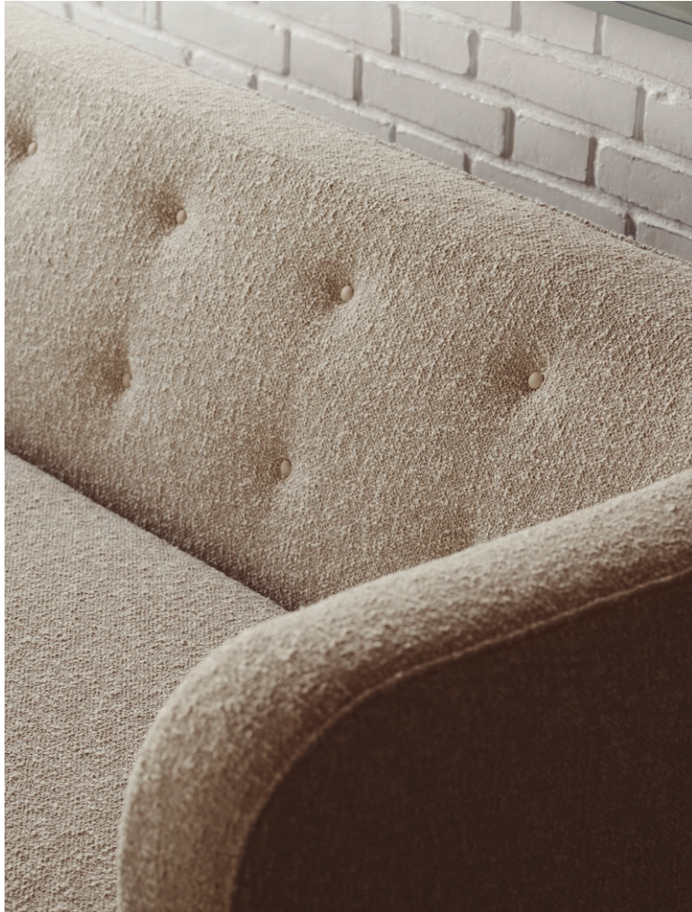
VILHELM SOFA Designed by Flemming Lassen